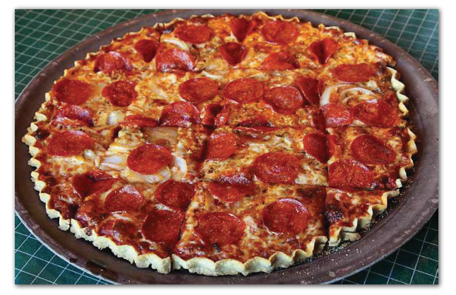
(Beer Crust Pictured Above)

Choose Sauce: Pizza • BBQ • Teriyaki • Buffalo